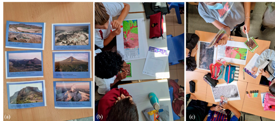
Figure 3. Workshop evidence: (a) cards of volcanic buildings of volcanoes of the world (own production); (b,c) primary school students working with the cards, maps, and field notebooks.