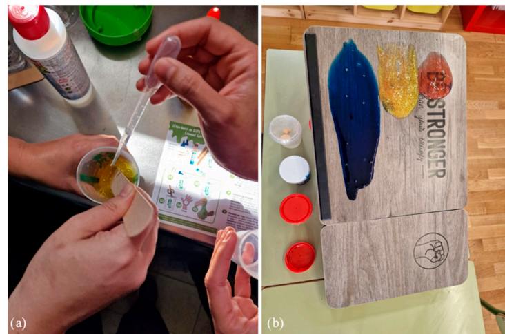
Figure 2. Workshop evidence: (a) production of polymeric fluids (slime) with different viscosities; (b) slime race experience in the classroom.

The fourth activity consisted of simulating a volcanic chamber and a live eruption, to bring the students a demonstration of the influence of gas accumulation and magma viscosity as key factors that determine the explosiveness of a volcano. Materials used to make this experiment were slime, syringes, water, and effervescent pills. Deductive methodology will be employed.