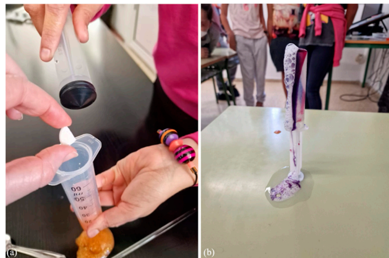
Figure 4. Workshop evidence. Experiment with effervescent tablets and slime to simulate a volcanic eruption in the classroom: (a) set-up of the experiment; (b) result after the low-viscosity experiment.

To obtain a better understanding about the explosiveness of a volcano, a simple experiment was carried out. With this intention, the eruptive process was simplified by using the phenomenon of effervescence, which allows a rapid accumulation of gases inside a container. In this case, the container was a 5 mL syringe filled with slime and water, to which an effervescent vitamin tablet was added. The syringe represents the magmatic chamber in which the gases produced by the effervescent tablet accumulate. The outlet of the syringe was plugged with 1 mL of slime, which prevented the gases from escaping. The more liquid mixtures emerged from the syringe in a fluid form, while the more viscous mixtures clogged the hole until they reached a pressure that caused them to come out explosively. Finally, a highly explosive volcano was simulated using a film canister, where the lid represented the highly viscous magma. This experiment amazed both pupils and teachers. You can see an example of this activity in Figure 4.