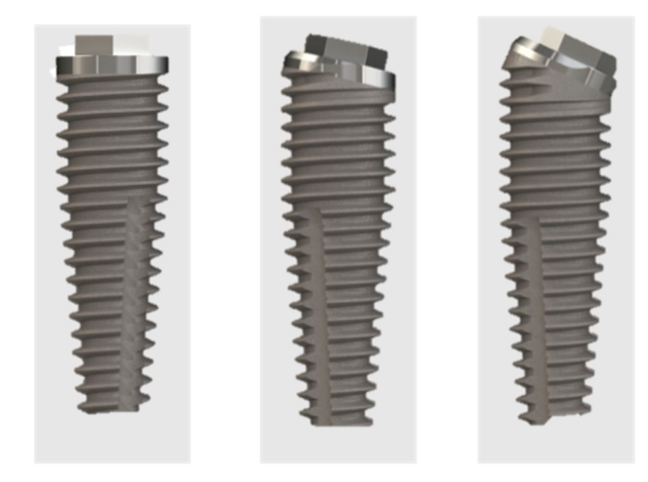
Figure 1. IBT External Hex implant ( left ) and IBR Co-Axis<sup>®</sup> Implants (Southern Implants) with a 12^{\circ} ( center ) and 24^{\circ} ( right ) angulation of the implant shoulder.

In each patient, two different types of external hex tapered implants (IBT External Hex and IBR Co-Axis<sup>®</sup> Implants, Southern Implants) with identical macro- and micro-topography were placed that differed only in the shoulder design (Figure 1). One of the distal implant sites, where a tilted implant positioning was planned, was randomly selected by extraction and received a Co-Axis<sup>®</sup> external hexagon implant with a 24° implant platform angulation, while the remaining implant sites received standard external hexagon implants.