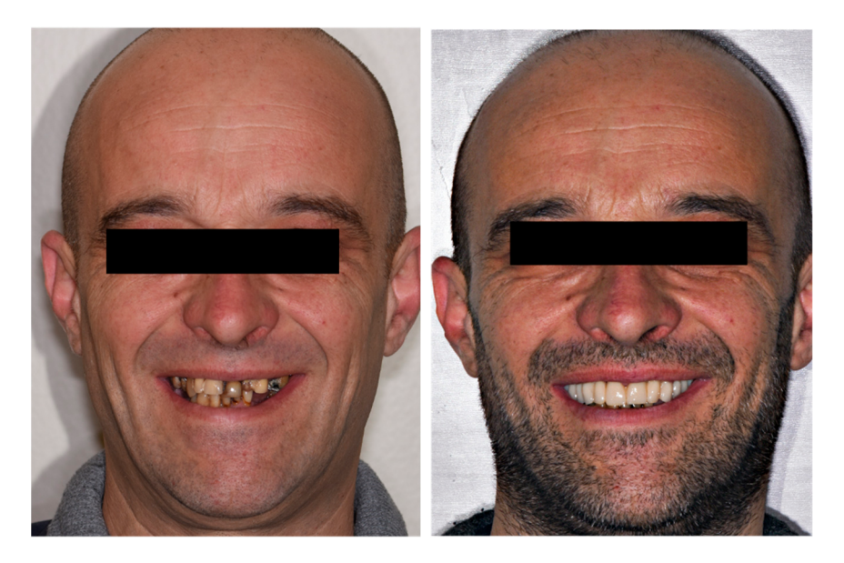
Figure 4. Extraoral pictures taken before treatment ( left ) and at the delivery of the immediate loading prosthesis ( right ) of the same patient.

Figure 3. Intraoral pictures taken before treatment ( left ) and at the delivery of the immediate loading prosthesis ( right ) of the same patient of Figure 1.