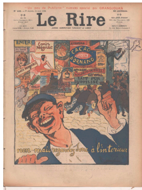
Figure 7. Grandjouan, “Non mais regardez donc à l’intérieur!”, Le Rire , 16 août 1902, p. 1. Paris, BNF.