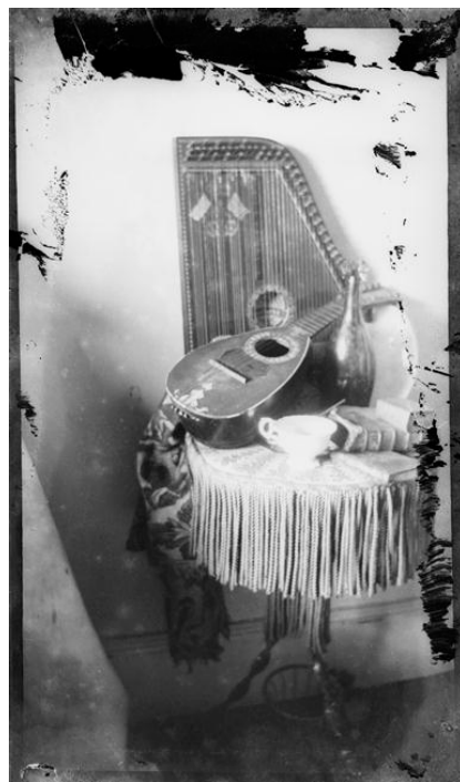
Figure 4. Pablo Picasso. Composition photographique 'Nature morte sur un guéridon' . 1911. Paris, musée national Picasso.

In the photograph, he shot of a corner of his studio, Composition photographique "Nature morte sur un guéridon" (Figure 4); Picasso juxtaposes various objects on a fringed placemat. In the Mandoliniste , a hardly readable canvas from the fall of 1911, in La table de l'architecte , from the spring of 1912, 34 or in other paintings from the same period, Picasso depicts an extensive range of decorative and upholstery elements: tassels, braids, fringes, tiebacks, and ropes—so many motifs that, in their excess, parallel the series of Intérieurs parisiens photographed by Eugène Atget in 1910. The "Intérieur d'un employé aux magasins du Louvre" (Figure 5), with its pompoms and its studs (and its Henri II style furniture, probably purchased from Dufayel); the "Intérieur d'un ouvrier: rue Romainville" (Figure 6), with its wallpaper and fringes; and the "Intérieur d'une ouvrière rue de Belleville", with its accumulation of heterogeneous objects (Atget 1910) are exemplary of the taste and style of the more prosperous population of the petite bourgeois. Picasso proceeds with a search for overabundance, which is that of the period and particularly of the taste of these new emerging classes, which Atget captures in his Interieurs (4, 5, 6).