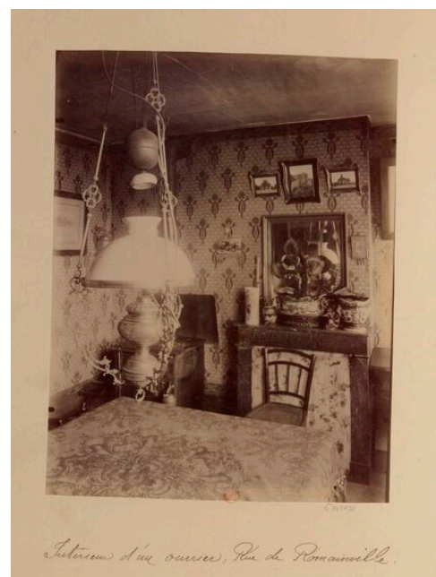
Figure 6. Eugène Atget, Intérieurs Parisiens , Intérieur d’un ouvrier: rue Romainville , Paris, 1910–1911. Paris, BNF, département des Estampes et de la Photographie.

The essential Henri II buffet, popularized by Dufayel, was found in 1936, according to Marie-Thérèse Walter who remembers that on their rental villa in Juan-les-Pins, Picasso “[...] especially painted the Henry II sideboard that we had”. 35