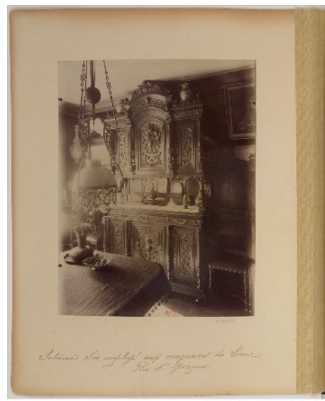
Figure 5. Eugène Atget, Intérieurs Parisiens , “Intérieur d’un employé aux magasins du Louvre”, Paris, 1910–1911. Paris, BNF, département des Estampes et de la Photographie.