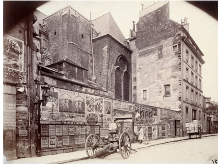
Figure 2. Eugène Atget, Rue de l'Abbaye, Saint-Germain-des-Prés , 1898. Paris, BNF, département des Estampes et de la Photographie, Estampes.

ture, which oscillated between the reassuring traditionalism of historicist furniture or architecture and a provocative modernity. One can also observe the shifts in working class and bourgeois culture that were manifested in the vigorous surges in consumerism transforming French society.